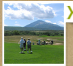
ACTIVITIES & ATTRACTIONS